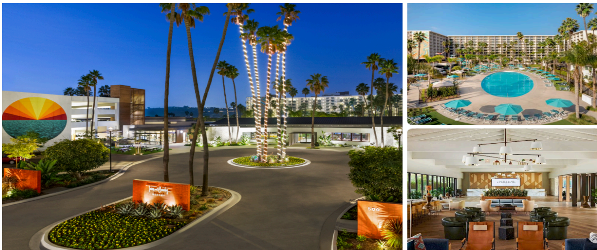
Town & Country Resort – San Diego, CA

The 2026 California APCO Annual State Conference is proudly hosted by the Northern and Southern California Chapters of APCO International. This premier event is expected to draw attendees from across the country – particularly from the Western Region and the States of California, Nevada, and Arizona. With the upcoming APCO International Conferences scheduled in Portland and Baltimore in 2026, this Annual Conference offers the best opportunity to connect with public safety communications professionals on the West Coast.