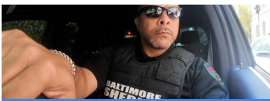
BLOG | November 19, 2024