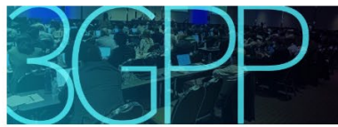
BLOG | November 05, 2024