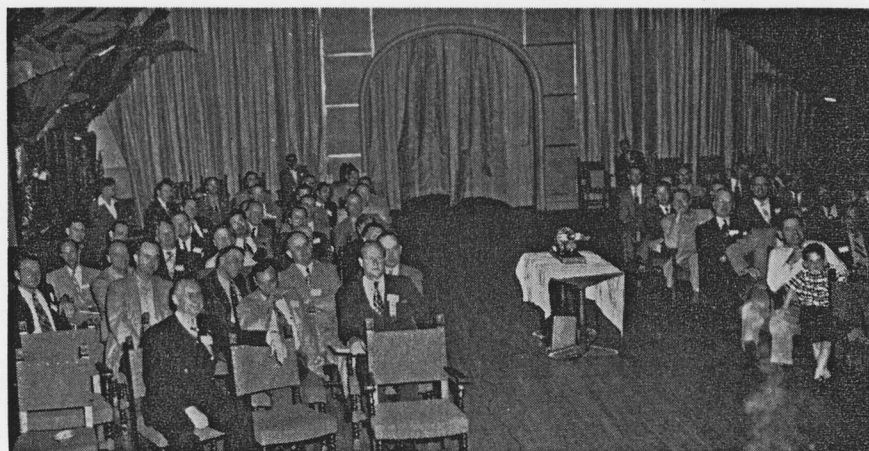
California annual joint meeting held at Pasadena on May 26th and 27th.