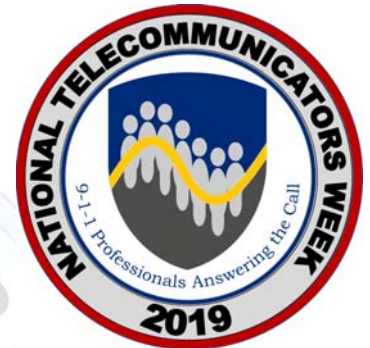
2019 National Telecommunicators Week Button

Disaster Preparedness and Emergency Communications