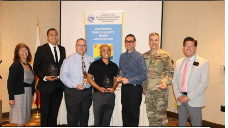
A Few of Our 2018 Telecommunicator & Technologist Awards Recipients