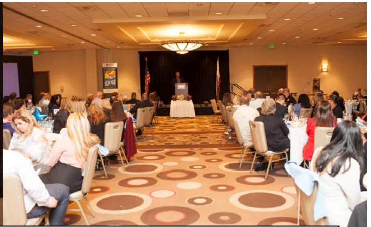
2018 Annual National Telecommunicators Week Awards Banquet – Knott’s Berry Farm