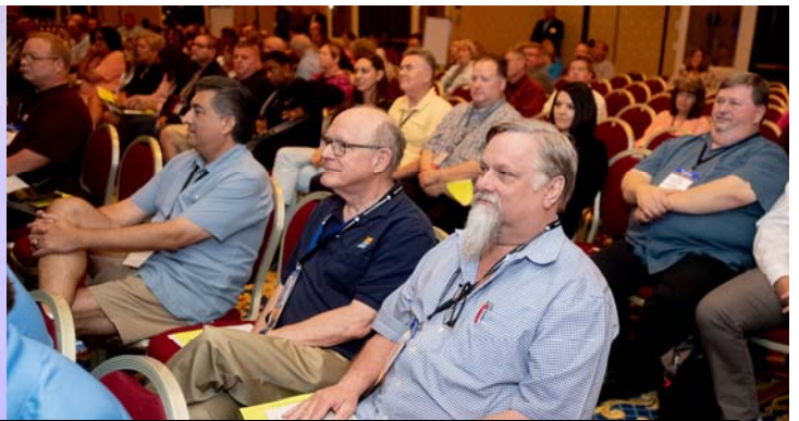
Our New Life Members – 2018 APCO Annual Conference – Las Vegas, NV